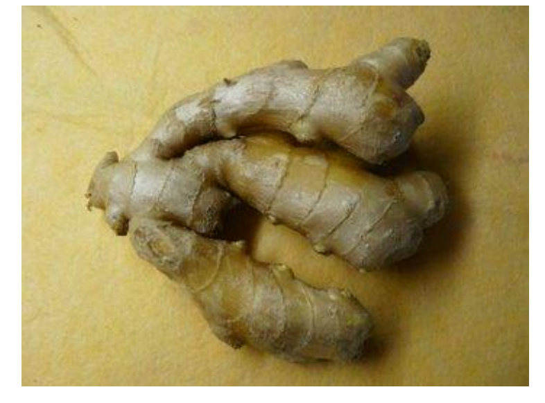
Figure 6. Rhizome of ginger ( Zingiber officinale ) with leaf scars that look ring-like.

rhizome that adds spice to our cooking? ---- An example is ginger ( Zingiber officinale ) [photo]. Its fleshy rhizomes bear thin scale-like leaves when removed from the ground. Ginger prepared for the grocery store usually has had its scaly leaves removed. The leaf scars are somewhat ring-like and indicate the position of nodes. As is typical of nodes, a bud occurs in the leaf axil. The internodes are very short.