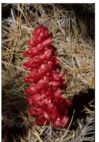
Figure 1. Sarcodes sanguinea.

To exemplify a generalized flowering plant, what parts would you show and label in a drawing or in a photograph? Let's look at a buckeye ( Aesculus californica ) (Figure 2). Roots anchor it into the ground. A shoot consisting initially of a primary stem is above ground. Stems bear leaves. Leaves typically consist of a flat blade extending from a "stem" portion, the petiole (Latin petiolus = little foot, little stalk). When eating