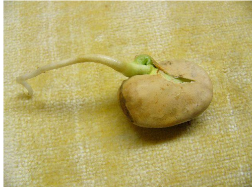
Figure 3. Faba bean root emerging.

Roots: Roots are anchoring and absorbing organs. A more detailed study of root structure and function is beyond the scope of this document. We can observe the initial or primary root while the plant is still within the seed (Figure 3). Upon germination, the primary root may form a taproot system growing downward and producing lateral or axillary roots as seen with the buckeye (Figure 2). A carrot ( Daucus carota ) [photo] is a good example of a taproot . In other cases, a taproot is ephemeral and replaced by numerous secondary roots forming a fibrous root system (Figure 4). Grasses exemplify a fibrous root system.